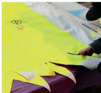
Above: Starblanket Project poster by Nina Yañez. Center: Starblanket workshop photo's by Tom Quirk.