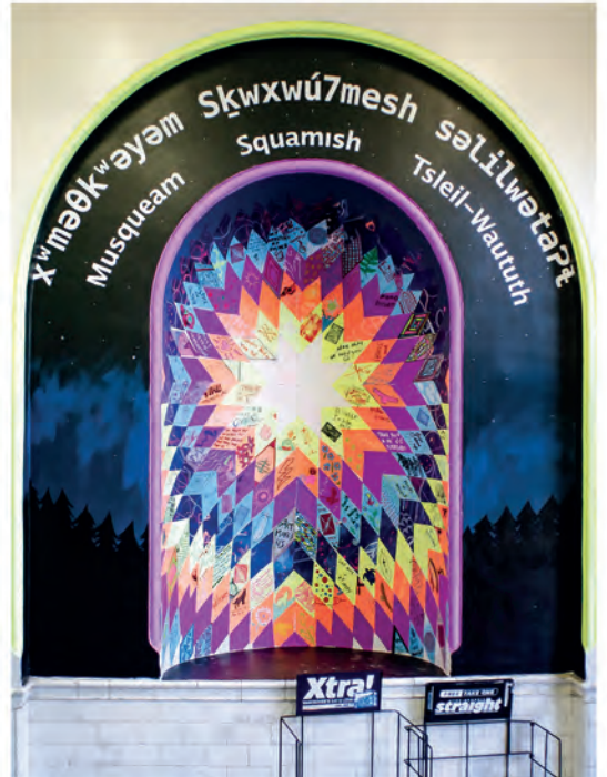
Above: Starblanket Project Installed at Carnegie Community Center, photo by WePress.