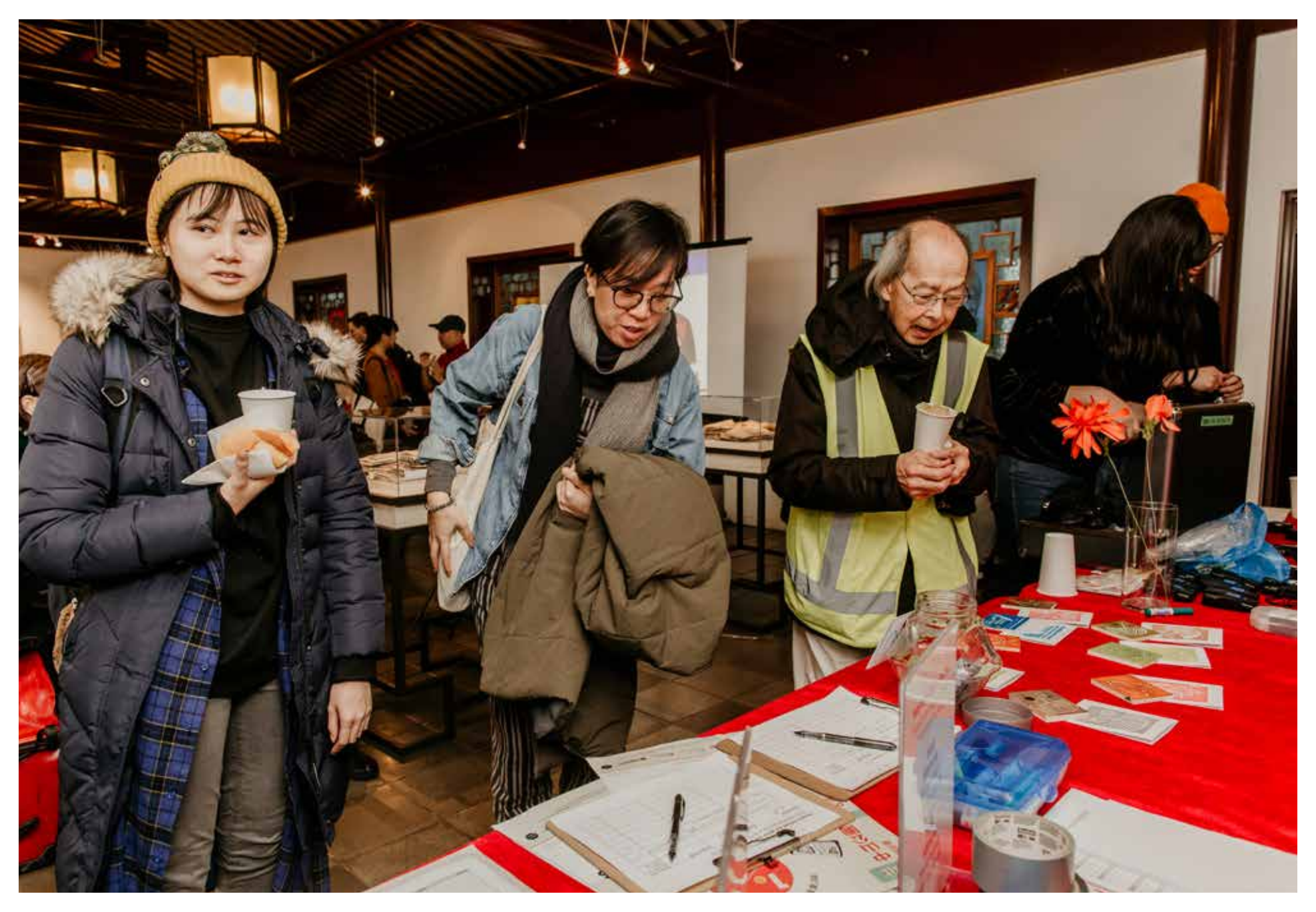
People signed up to pre-order the book that WePress plans to publish featuring this project and the stories of Chinese Seniors.