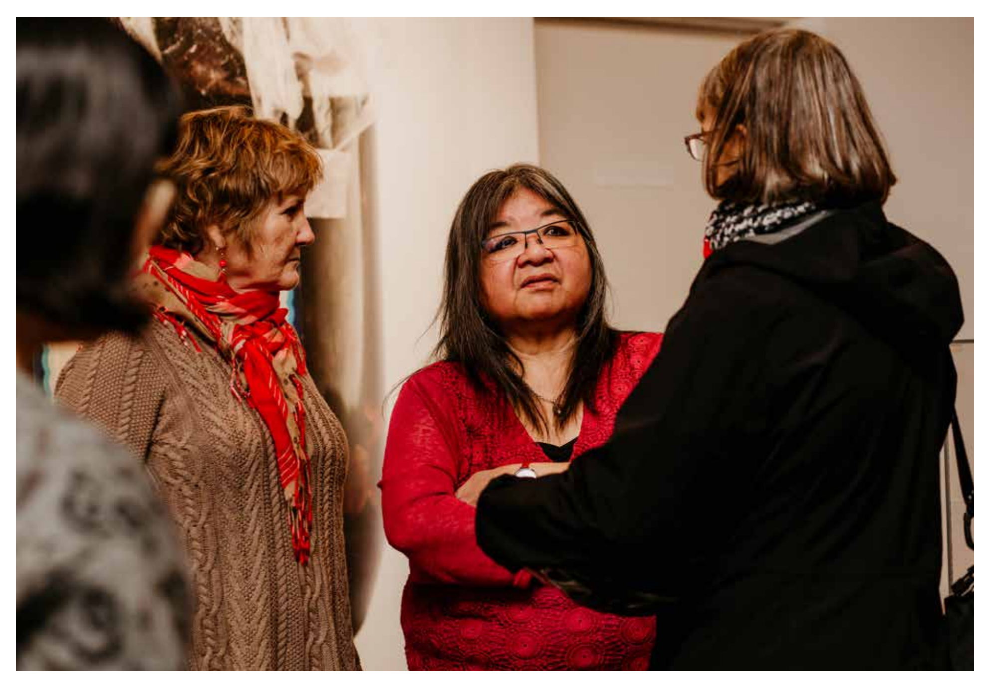
WePress Board members supported this project on many levels - from volunteering for the Organizing Committee to helping out at workshops and events.