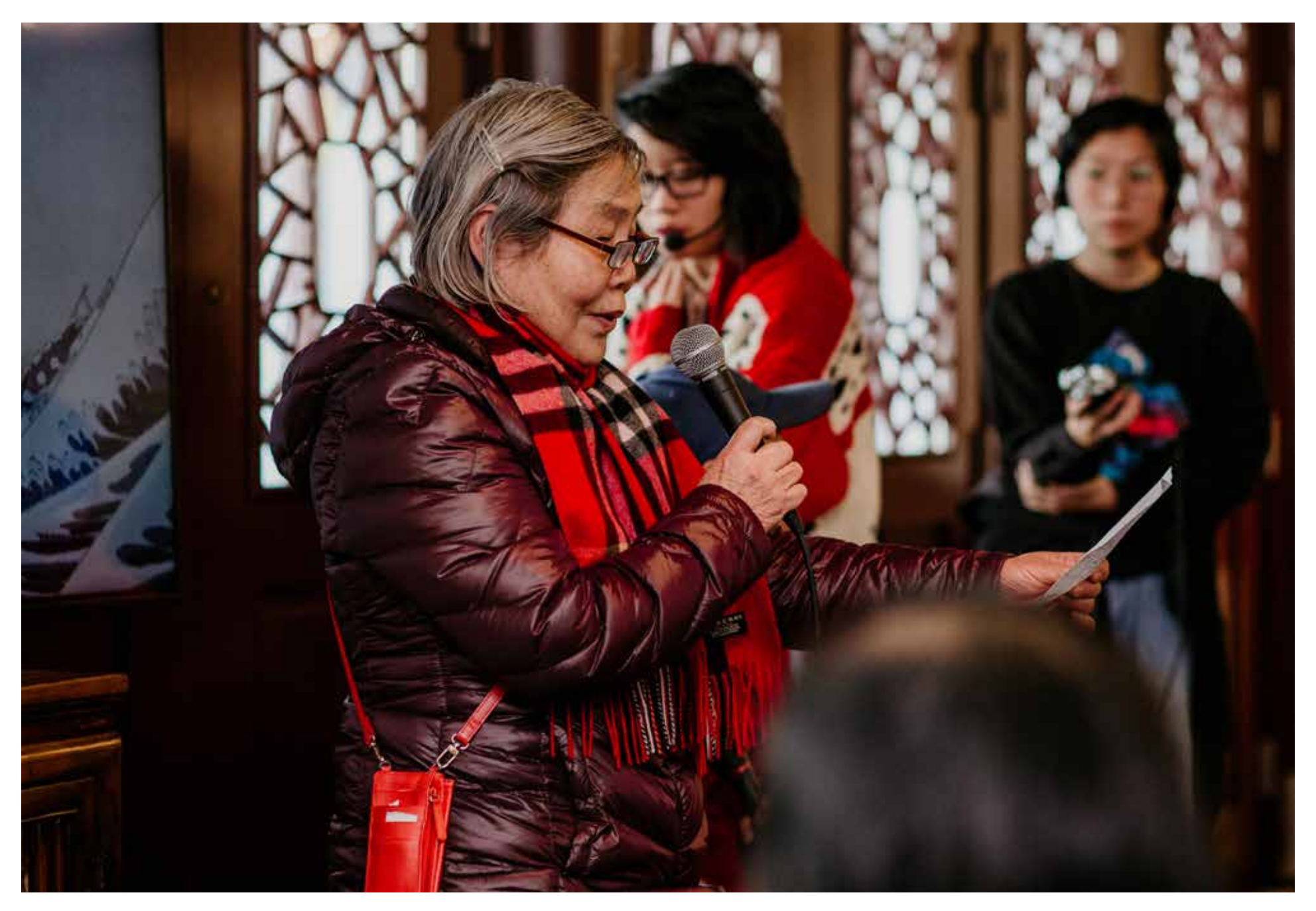
We Are All Artists put the stories of Chinese Seniors at the center of this public event.