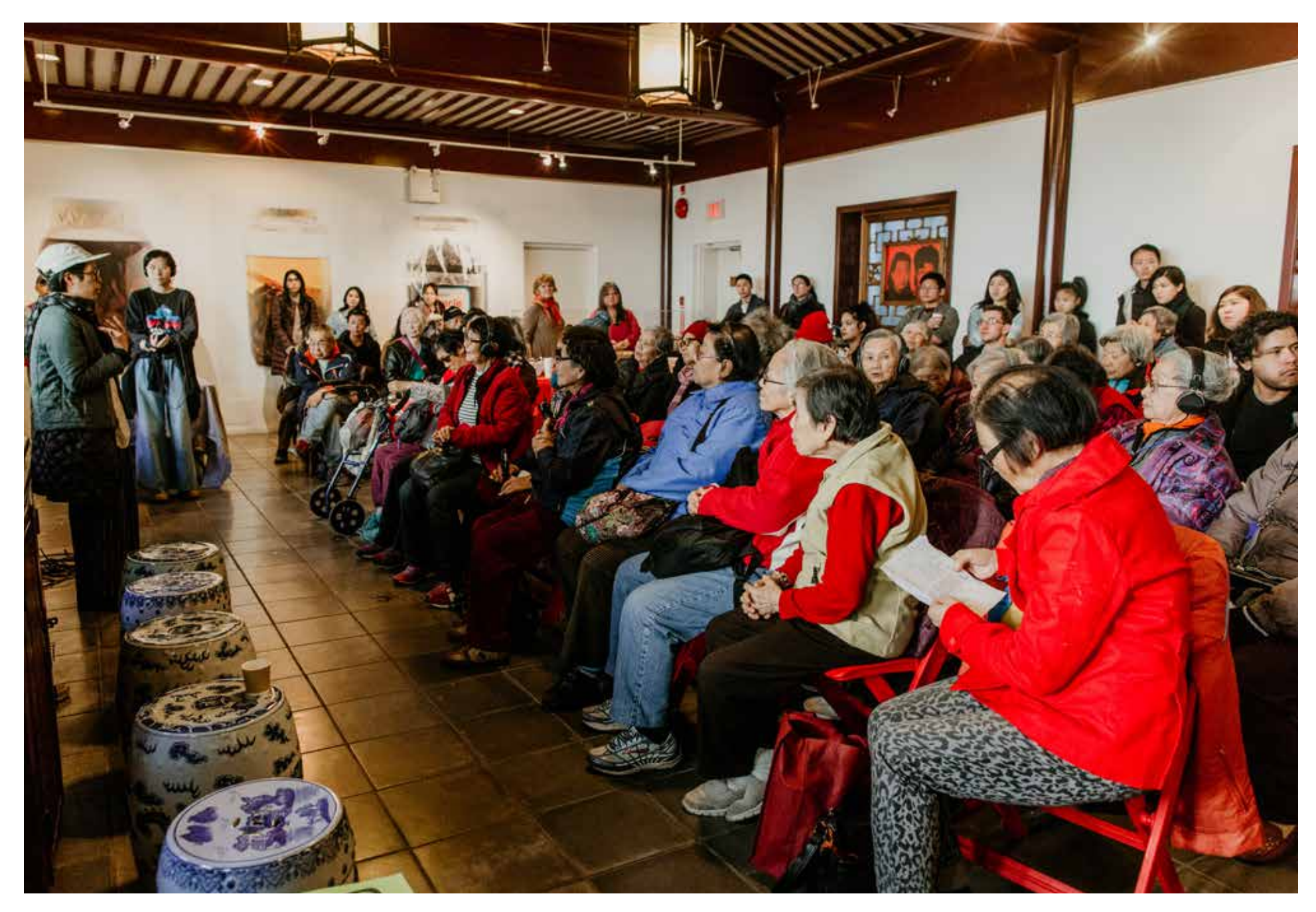
aly, a WePress Collective member of mixed chinese and filipinx ancestry, shares their perspective with a crowd of over 110 people.