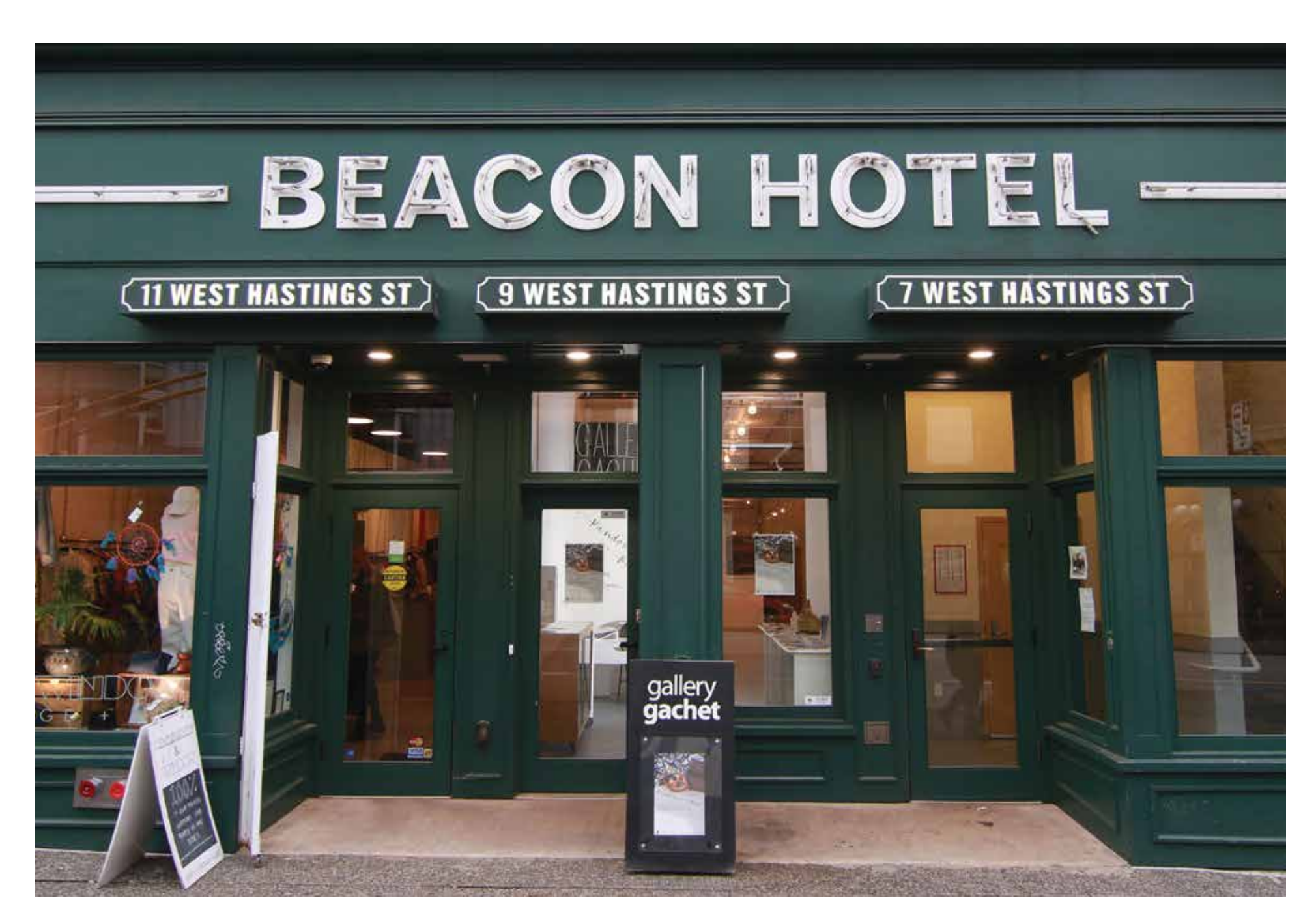
WePress Community Arts Space Society 2019