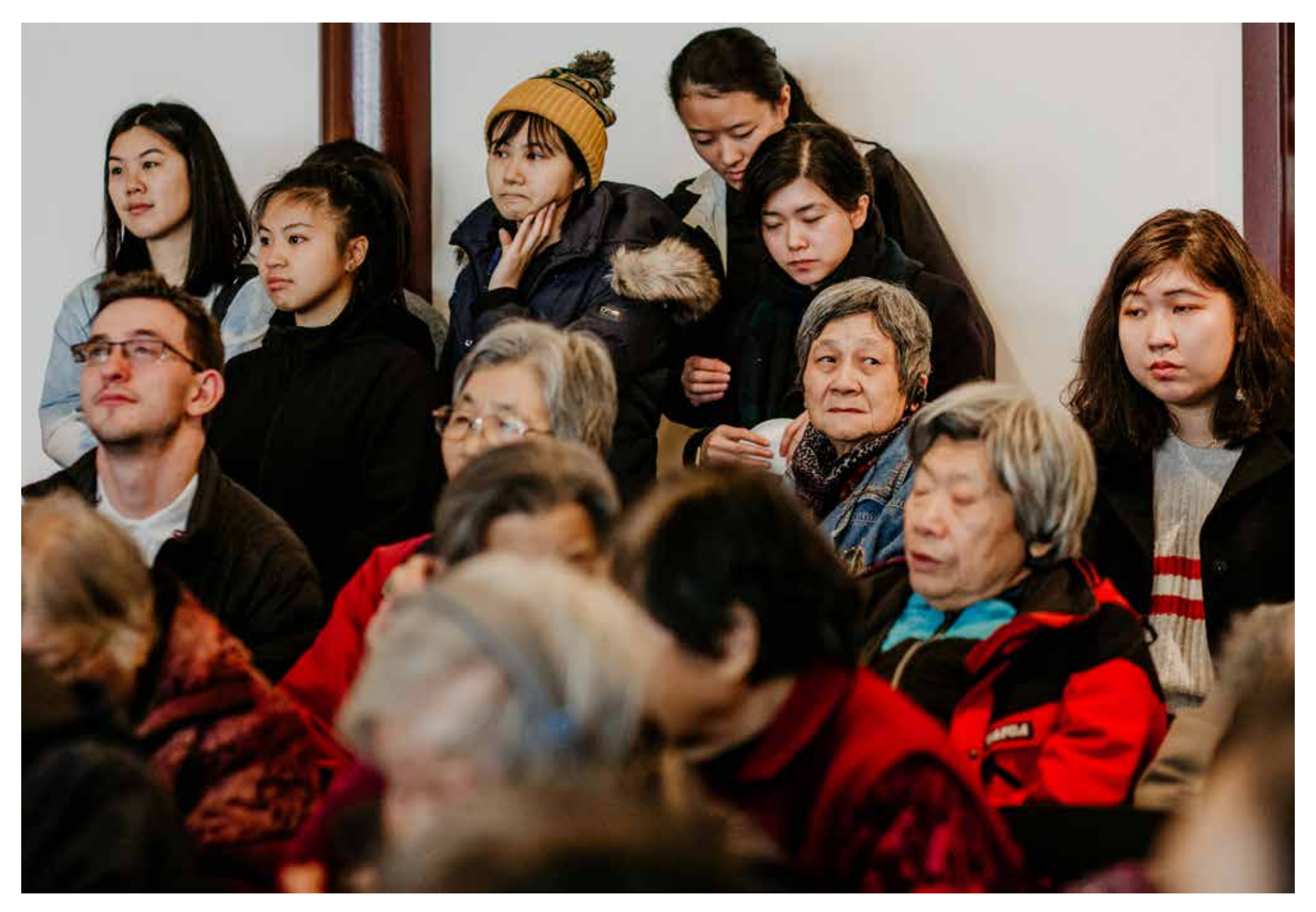
Young Chinese Canadians came to hear the stories of their Elders. We Are All Artists was truly an intergenerational, intercultural event.