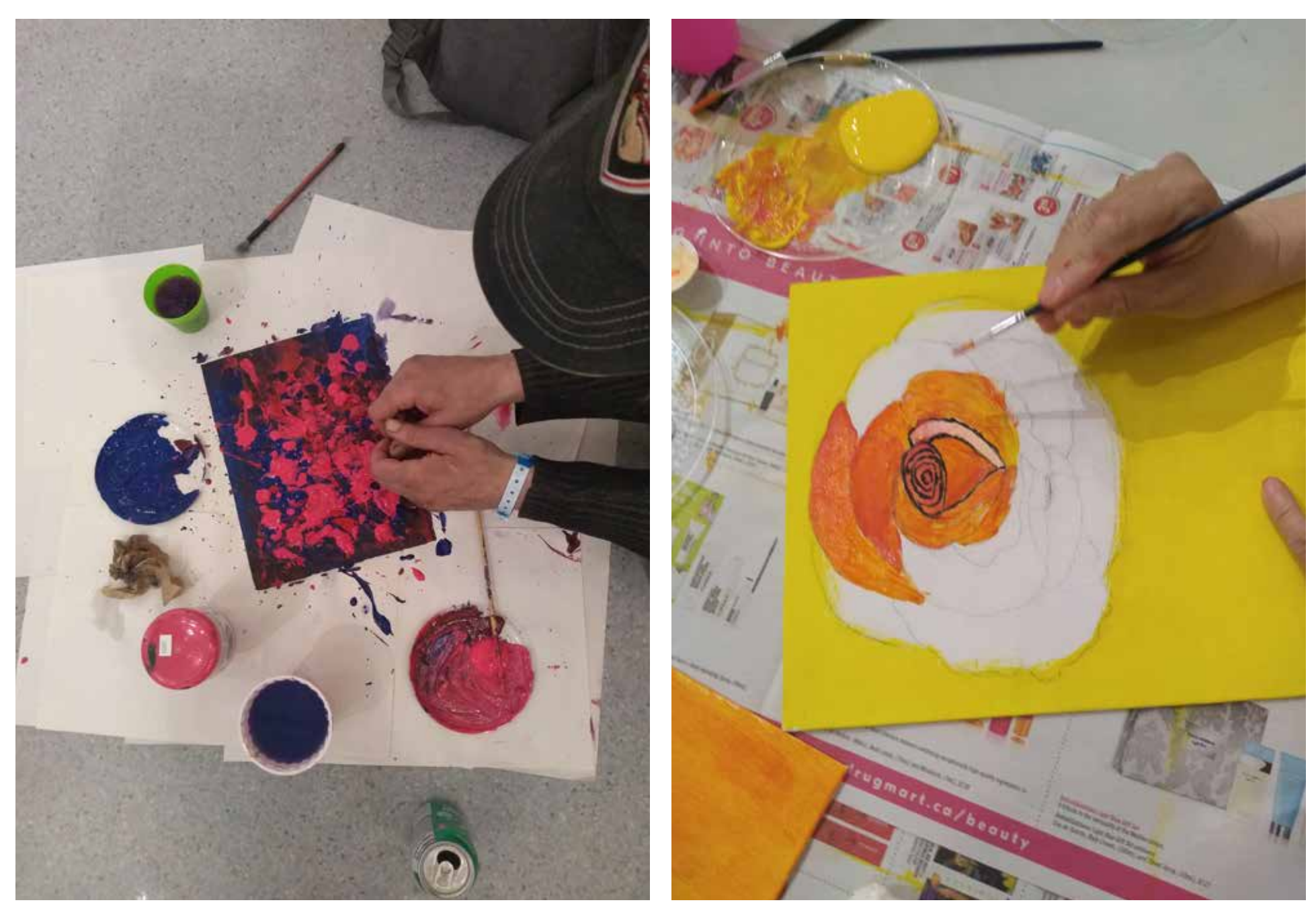
Artwork created by regular attendees of Open Studio drop-in art-making sessions that were held every Monday from 2 to 4 pm.