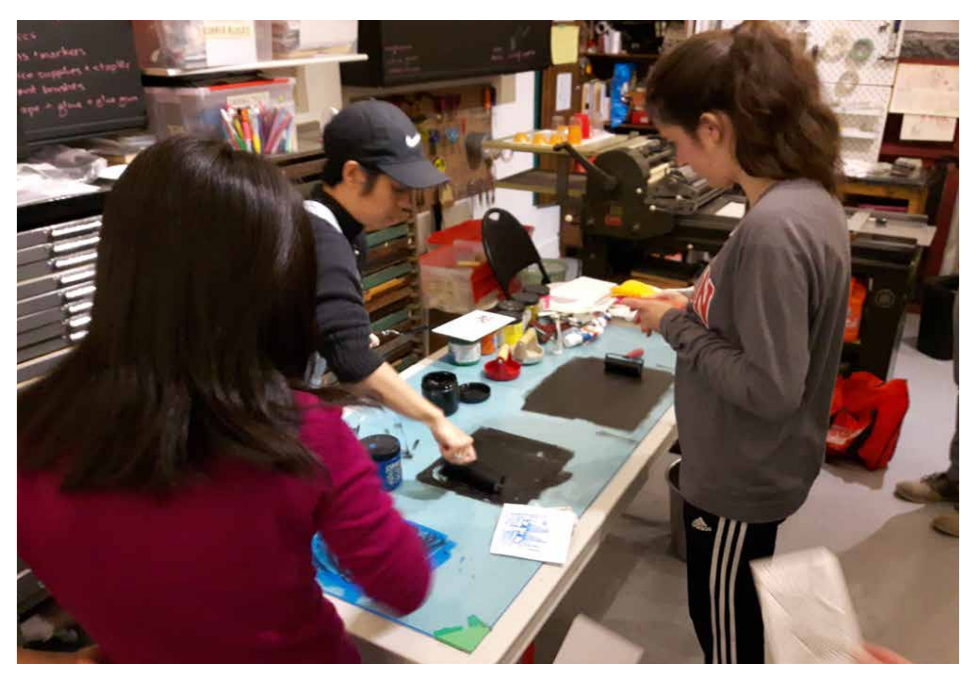
WePress and Gallery Gachet hosted a block printmaking workshop at our shared space as part of the 16th Annual Downtown Eastside Heart of the City Festival.