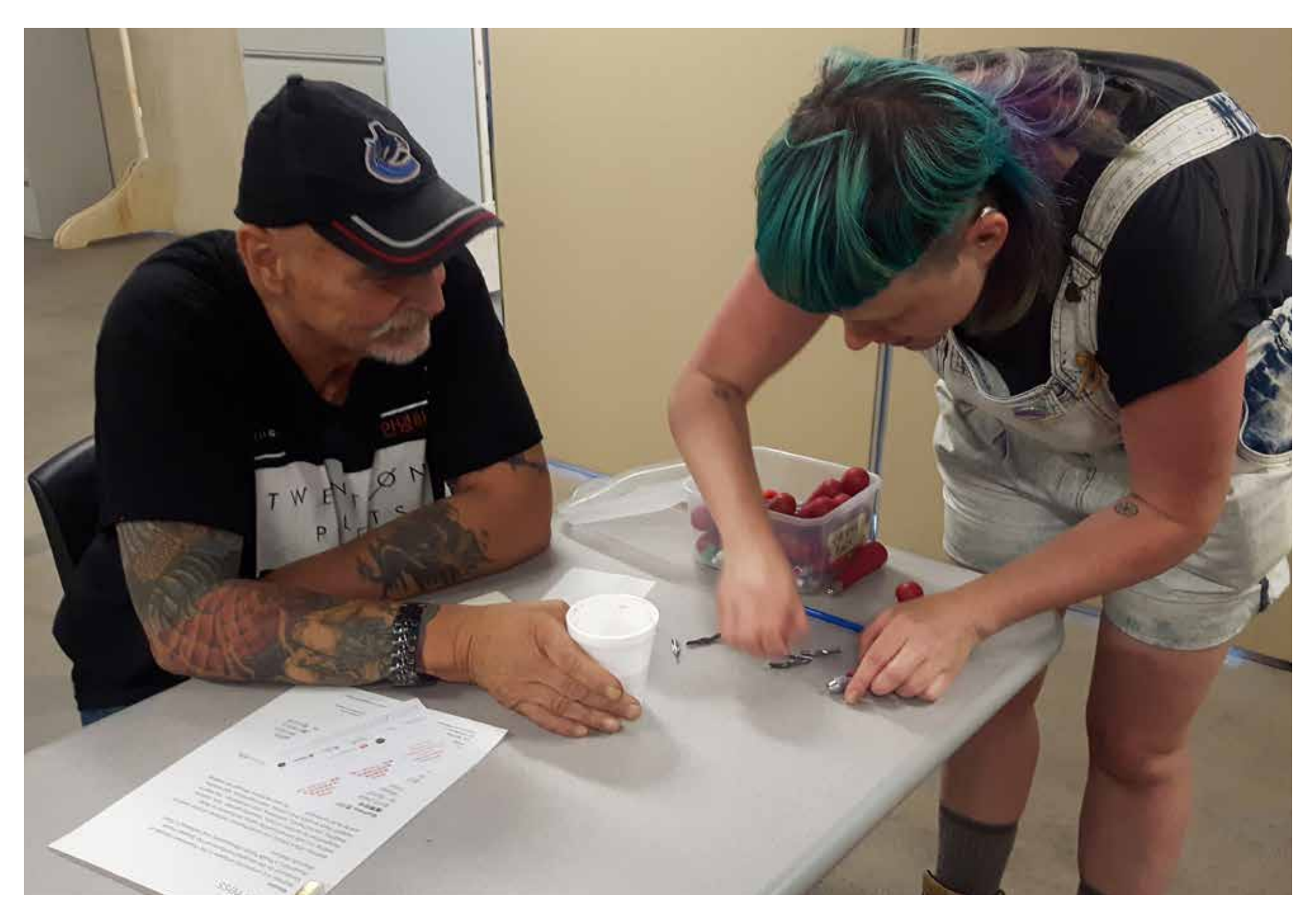
In this pilot project, WePress, Gallery Gachet, and The Capilano Review hosted a block printmaking workshop at EMBERS Eastside Works to help SRO tenants and members of Street Vendors Collective.