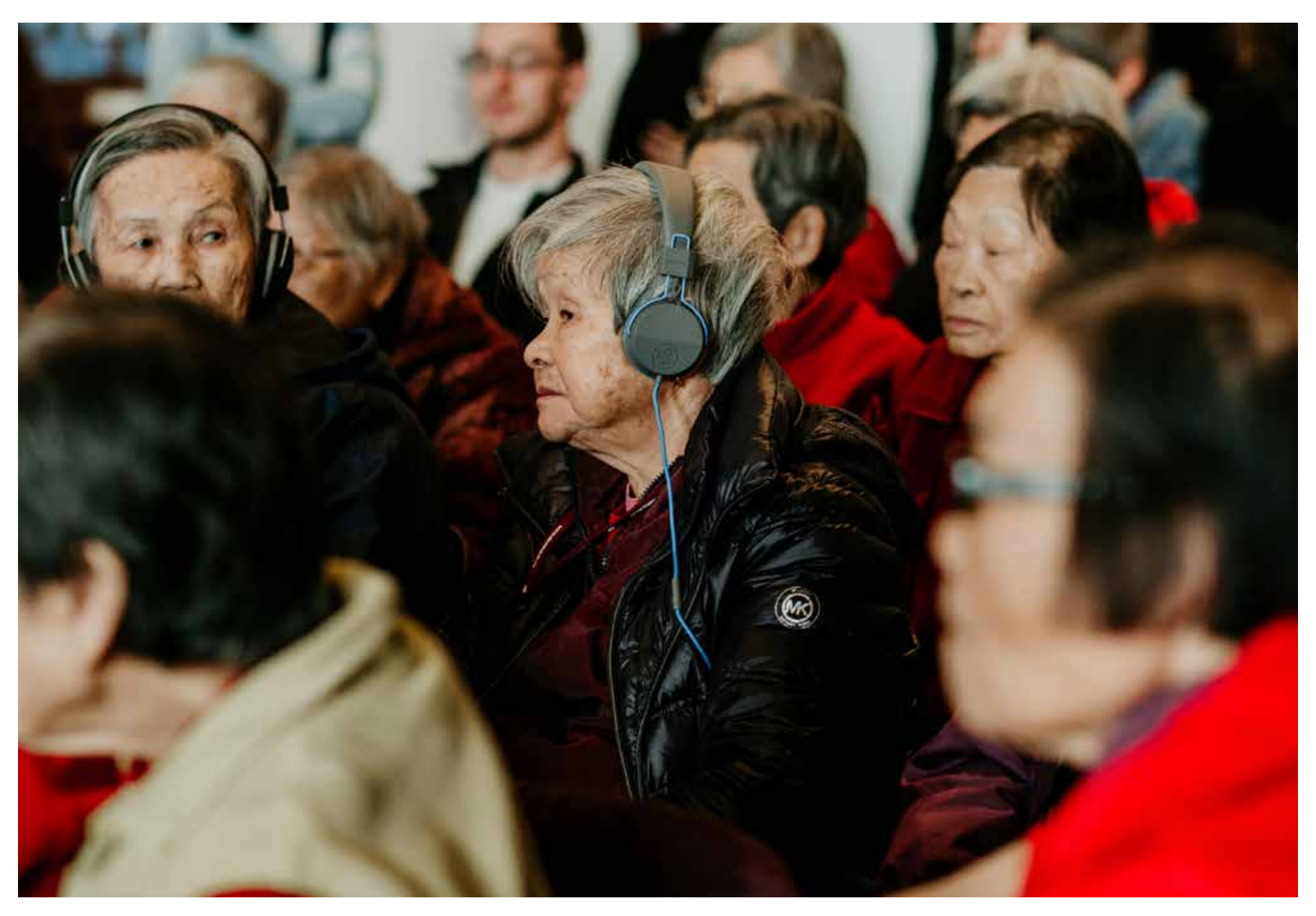
Simultaneous Translation Equipment allowed the speakers at our public event to present their information and share stories in Cantonese, Mandarin, and English.